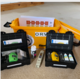
Chemical testing kit

40 members grew to 65 over the year and we expanded our water quality monitoring sites along the brook from 6 to 9. Two of these sites are within the parish of Abbots Ann; Vitacress and Mill Lane.