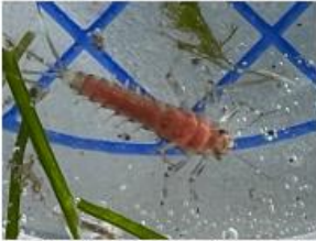
Red coloured mayfly nymph

Red mayfly nymph caught in the brook. Unfortunately not a rare and endangered olive (Baetidea) but one that has been snacking on the red algae Batrachospermum often referred to as the frogspawn algae. This algae is highly sensitive to pollution, making it a reliable indicator of clean and unpolluted freshwater environments.