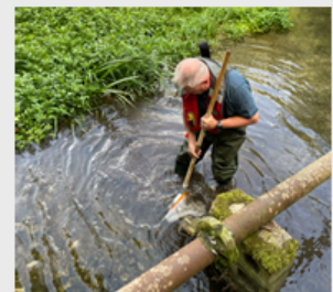
Kick sampling at Mill Lane

We have built and launched a website to keep everyone up to date on the results we are getting and what we are up to..